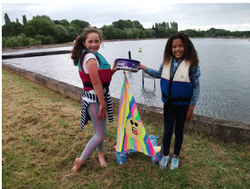
The Meredith Clan's prize winning Rainbow Warrior

Positions for tied scores determined by count back.