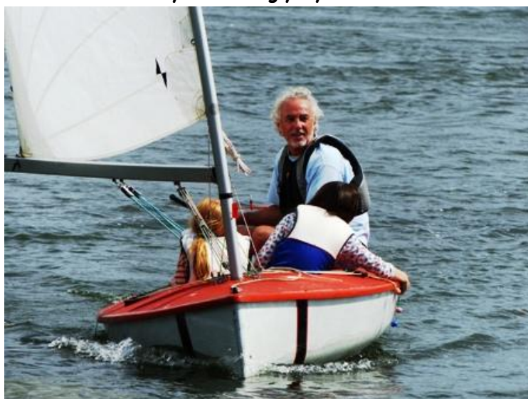
Trip round the bay for the Lightning Seeds