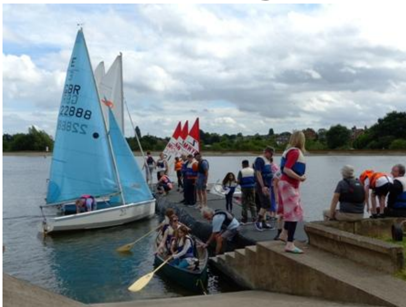
RNLI Afternoon in full swing!

The barbecues were lit in the evening and it has to be said that in some quarters the culinary skills extended well beyond the traditional burning of burgers and sausages!