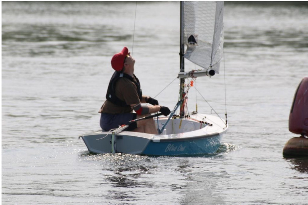
Perfect conditions for Moth sailing: Photo unaccredited

There are two kettles in the galley. On occasions when the Club is very busy they may get used simultaneously if there is a need to make a large number of hot drinks.